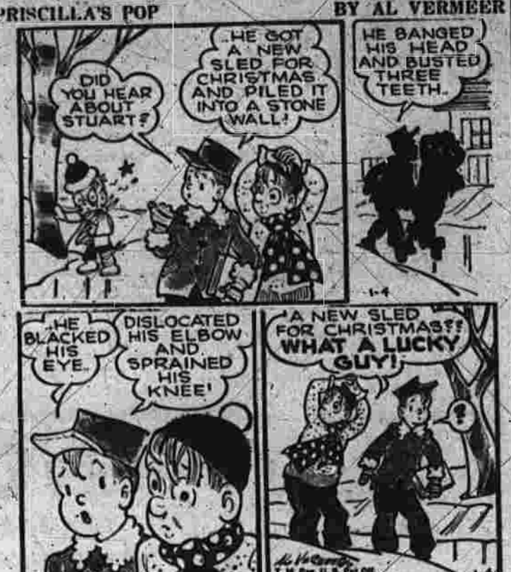
PRISCILLA'S POP BY AL VERMEER