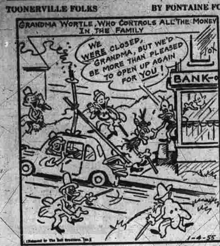
TOONERVILLE FOLKS BY PONTAINE FOX